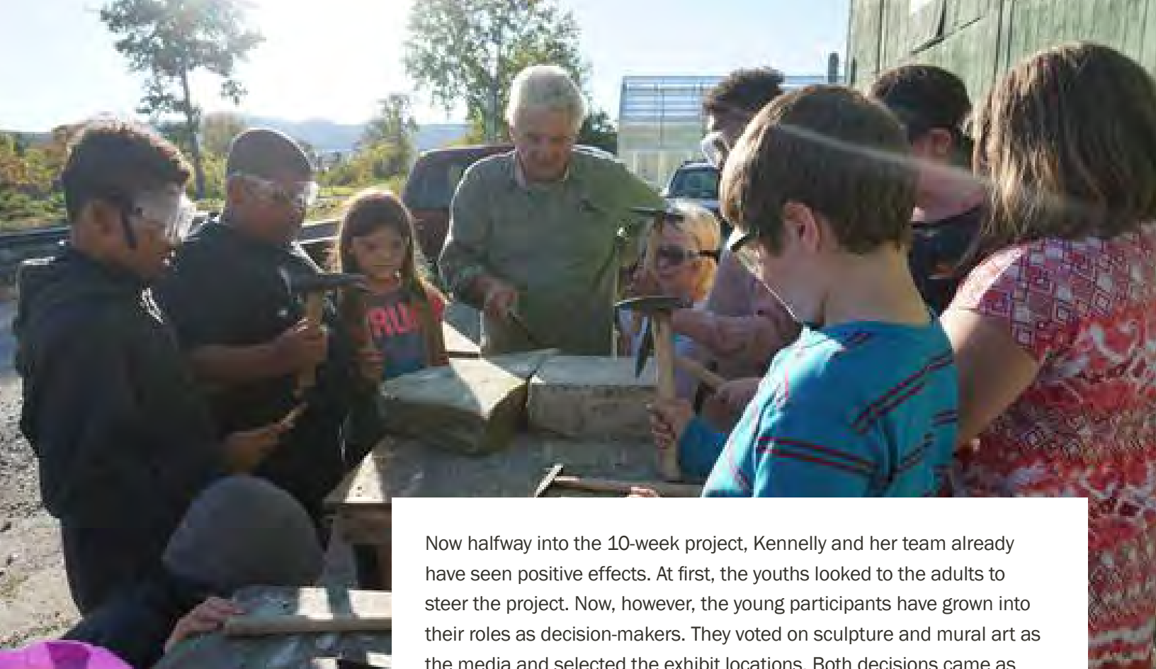
Together Art Grows (TAG).

To really understand the potential impact, “you have to be there,” she says. “You may not expect anything to happen, but it usually does.”