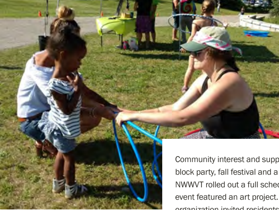
Hula Hoop Hoopla.